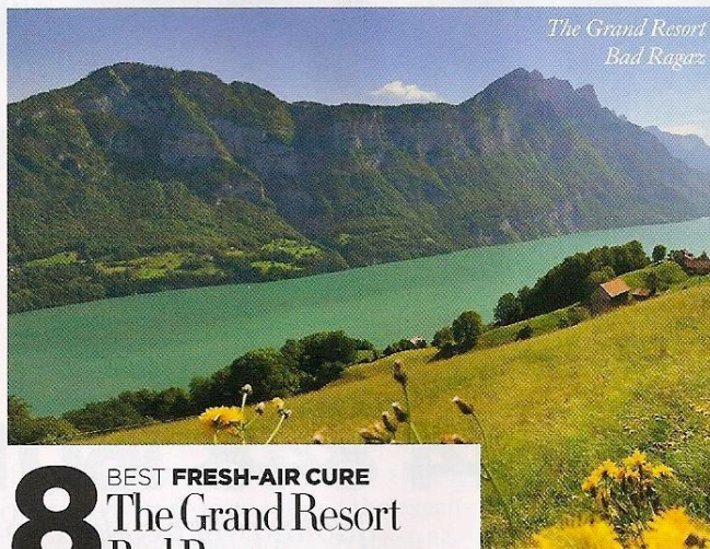
The Grand Resort Bad Ragaz