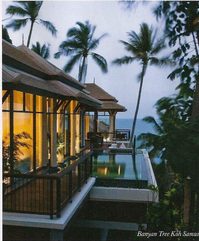
Banyan Tree Koh Samui

The Arcanum (0845 505 0565; www.arcanum-phuket.com), from £360 a person a night full board. Seven nights at Banyan Tree Koh Samui (+66 77 915 333; www.banyantree.com), from about £1,878 a person.